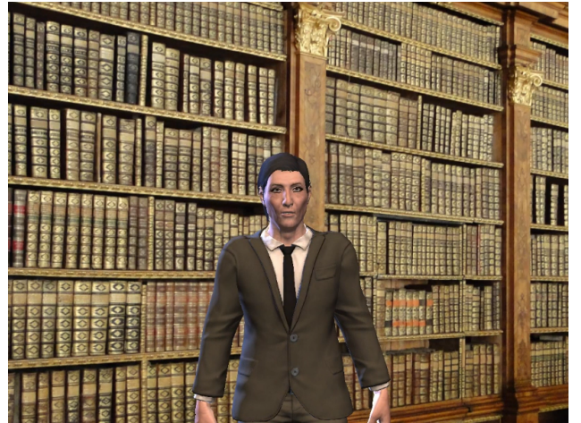
Figure 1: The conversational agent operated by the wizard