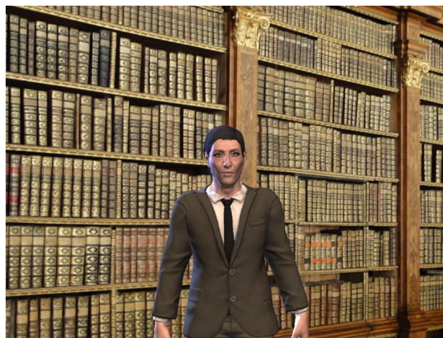
Figure 1: The conversational agent operated by the wizard