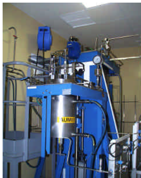
Figure 2: View of the apparatus (extraction vessel)

A view of a part of the apparatus is given in the figure 2.