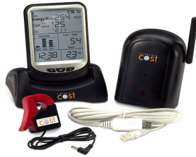
Fig. 2. Data Acquisition

To validate the profiles of the different household loads, we have equipped our house with a power measurement system at the general meter, coupled with wall outlets for measuring the consumption of the various appliances. This is the All Green system equipped by Current Cost (see Fig 2.2 www.my.currentcost.com ).