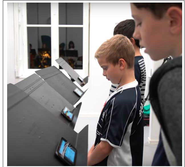
Figure 2. A SmartKids reading session during a French conservatoire formation musicale lesson.