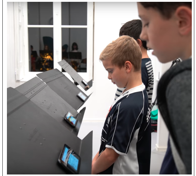
Figure 2. A SmartKids reading session during a French conservatoire formation musicale lesson.