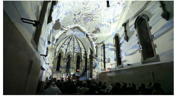
Figure 1. And the Sea , SmartVox used in performance with SKAM.