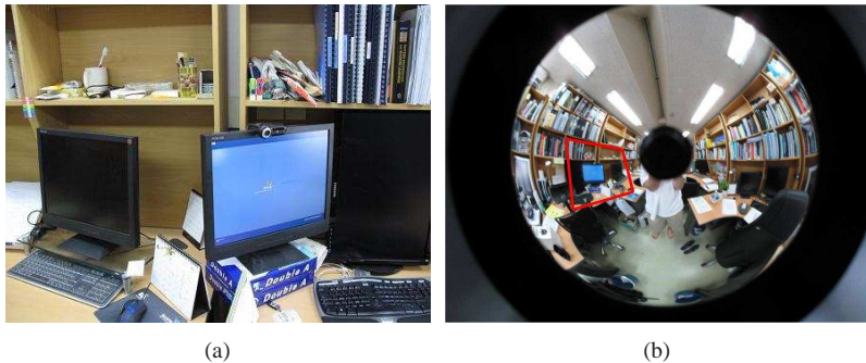
Figure 1: Compared to a traditional perspective camera (left), a catadioptric system (right) can gather much more information from the environment thanks to its wide field of view. These two images have been acquired at the same position. The red box (in the right image) corresponds to the portion of the perspective image included in the catadioptric image. In the following, we will refer to the blind spot at the image center as the “inner circle” and the large circular boundary as the “outer” circle.

of the paper and clearer explanations. In the third part, we present our proposed approach for target tracking by particle filter in catadioptric images. Finally, some experiments are performed to evaluate the proposed method.