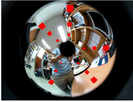
Figure 2: Example of adapted neighborhood with \theta_t = \phi_t = 4^\circ . Notice the size and the shape of the patches with respect to its location.

and intuitive solution is to divide the number of observation of each bin by the total number of observations. Thus each bin corresponds to the proportion of data and their sum is 1. Another solution consists in dividing each bin by the total number of pixels and multiplying by the bin width. Whereas this normalization is less intuitive, it permits to model the distribution by a probability density function (the area under the histogram is equal to 1) [5].