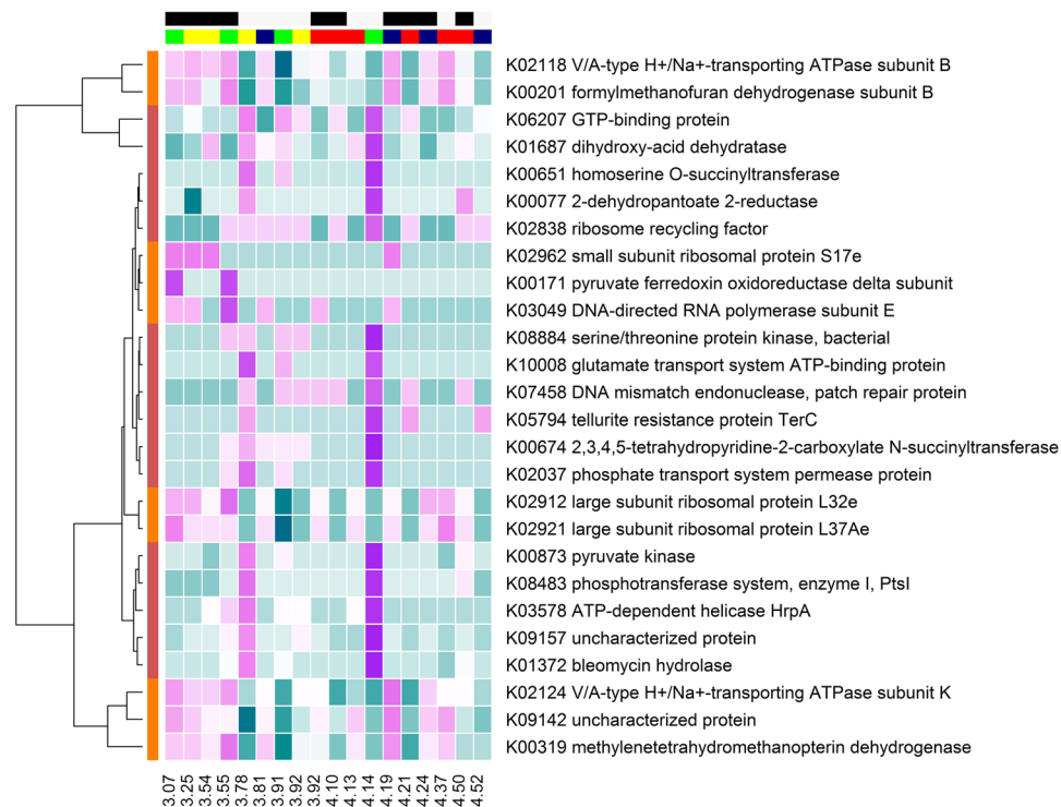
Figure 2. Heat map of the relative abundance of microbial genes associated with N isotopic discrimination as identified in the partial least squares analysis. The relative abundance of microbial genes (aqua = low to purple = high) changed depending on N isotopic discrimination. The coloured bars on the horizontal axis represent diet (CONT = yellow, LIPID = green, NIT = blue, COMB = red) and FCE (low = light grey, high = black). Coloured bars on the vertical axis represent the cluster in which genes were located (red = cluster 2, and orange = cluster 5). The values on the x-axis represent the corresponding \Delta^{15}\text{N} values for each animal arranged in ascending order.