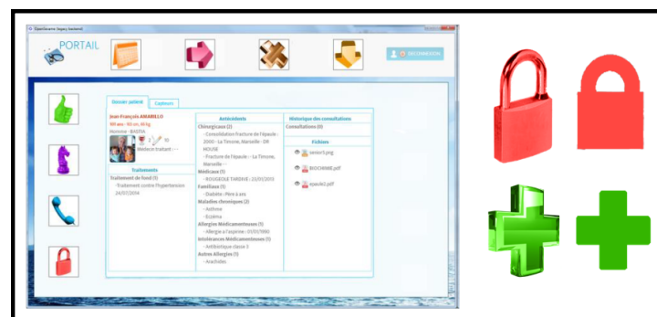
FIGURE 1: The IT platform and examples of visual stimuli with two levels of detail

The IT platform consisted of a screenshot of a HADAGIO portal page where we had defined eight positions in which the target could appear: four in the lefthand column and four along the top.