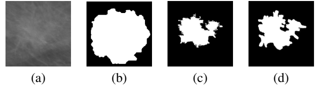
Fig. 1. Malign breast masses segmentation : (a) ROIs, (b) automatic segmentation result obtained in [6], (c) log-PRF automatic segmentation and (d) ground truth.