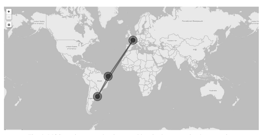
Fig. 4: MOSt environment showing a problem in the connection between sites

the degree to which a system is able to adapt to changes in workloads by resources provisioning and unprovisioning in an autonomic manner, so that at each point in time the available resources correspond to the workload demand as much as possible [7].