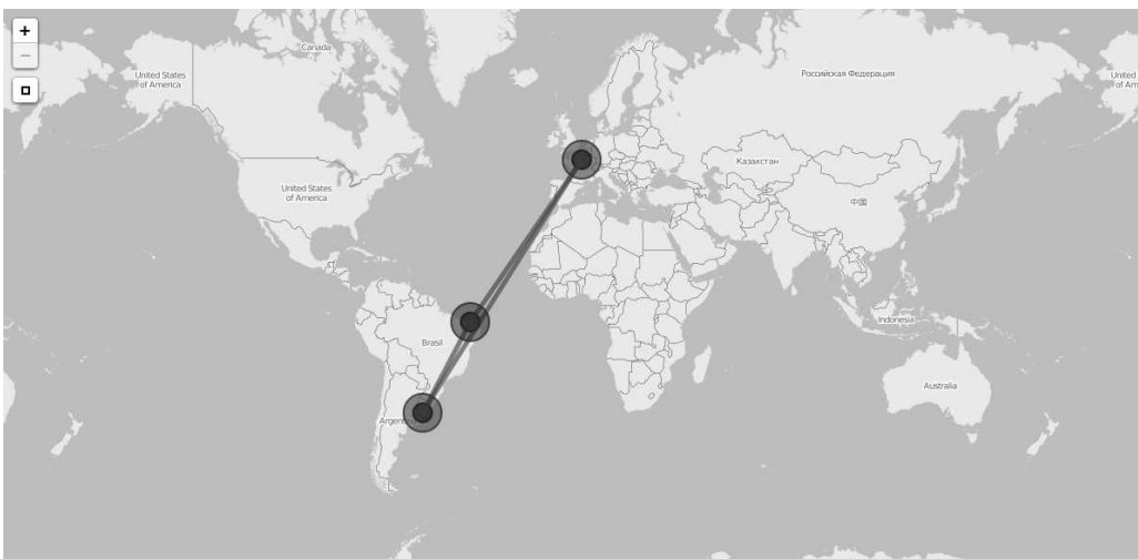
Fig. 4: MOST environment showing a problem in the connection between sites

the degree to which a system is able to adapt to changes in workloads by resources provisioning and unprovisioning in an autonomic manner, so that at each point in time the available resources correspond to the workload demand as much as possible [7].