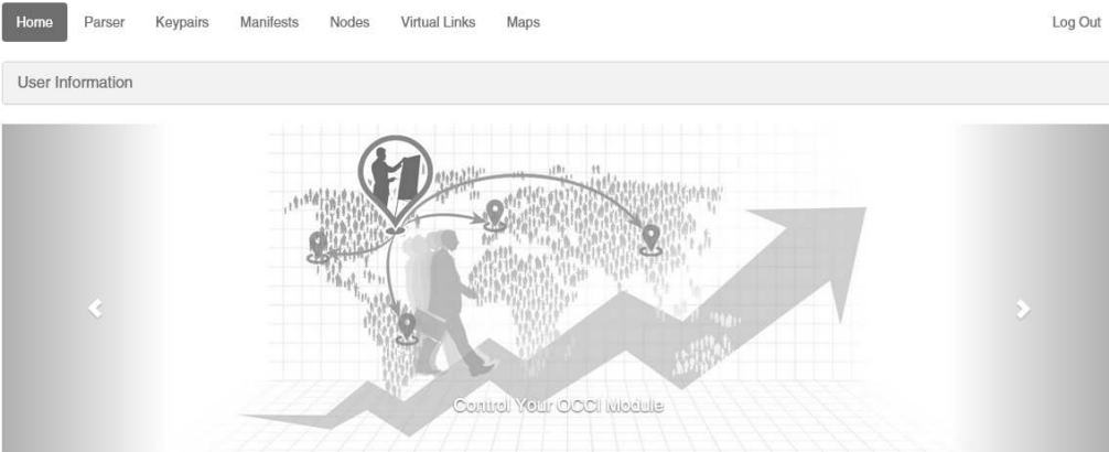
Fig. 1: MOST initial screen