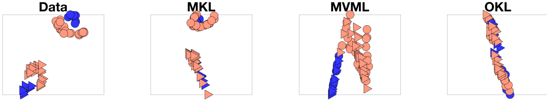
FIGURE 1 – Simple two-view dataset and its transformations - left : original data where one of the views is completely generated from the other by a linear transformation (a shear mapping followed by a rotation), left middle : MKL transformation, right middle : MVML transformation and right : OKL transformation. MVML shows a linear separation of classes (blue/pale red) of the views (circles/triangles), while MKL and OKL do not.

pare our method, MVML, to MKL that considers only within-view dependencies, and to output kernel learning (OKL) [8, 9] where separable kernels are learnt. We generated an extremely simple dataset of two classes and two views in \mathbb{R}^2 , allowing for visualization and understanding of the way the methods perform classification with multi-view data. The second view in the dataset is completely generated from the first, through a linear transformation (a shear mapping followed by a rotation). The generated data and transformation arising from applying the algorithms are shown in Figure 1. The space for transformed data is \mathbb{R}^2 since we used linear kernels for simplicity. Our MVML is the only method giving linear separation of the two classes. This means that it groups the data points into groups based on their class, not view, and thus is able to construct a good approximation of the initial data transformations by which we generated the second view.