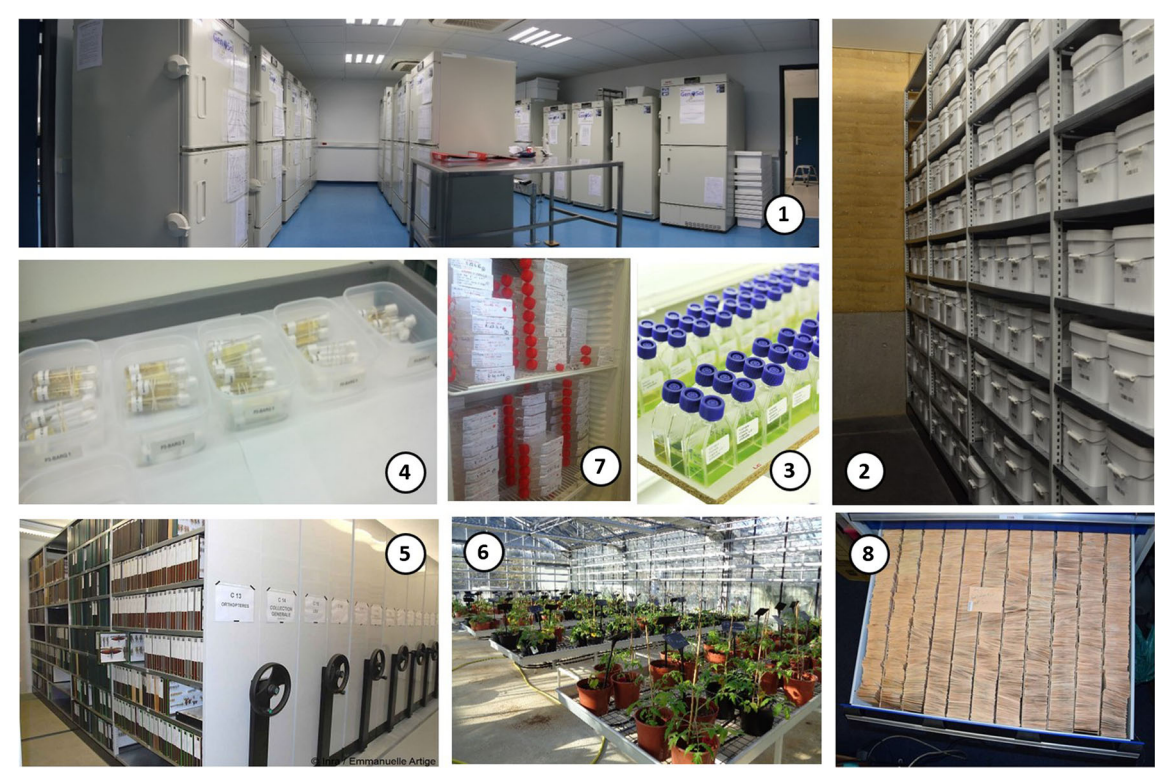
Fig. 1 Views of the BRCs and collections of the network BRC4Env. (1) Centre for Soil Genetic Resources GenoSol, (2) European Conservatory of Soils Samples, (3) Freshwater microalgae, (4) Egg Parasitoids