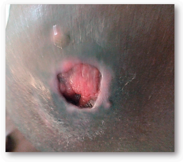
FIGURE 1. An indurated mass with purulent discharge next to the right shoulder joint.