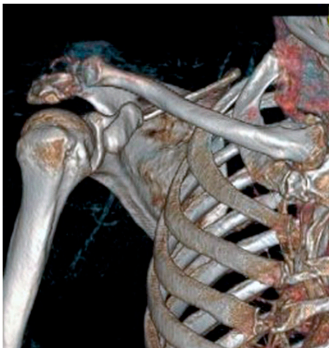
FIGURE 2. A computed tomography scan of the shoulder showing a purulent mass in contact with the acromioclavicular joint, with an osteolytic lesion of the right acromioclavicular articulation.

The diagnosis of chromoblastomycosis is based on direct examination, culture, and histopathology. Three infectious agents that are often involved in chromoblastomycosis are Fonsecaea pedrosoi , Phialophora verrucosa , and Cladophialophora carrionii . 4 Identification of etiological agents of chromoblastomycosis from culture of surgical bone biopsies with antifungal susceptibility testing is crucial