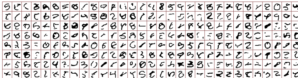
Figure 3: A random selection of symbols generated by one of our best sparse autoencoder, the same as the one that generated the letters in Figure 4(b).