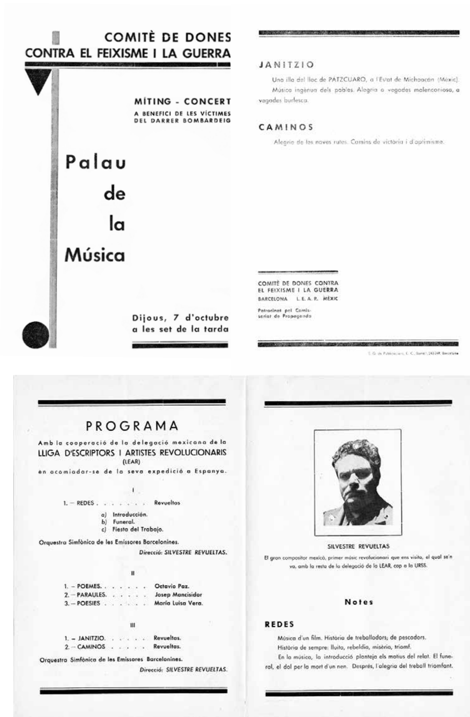
ILL. 5: the program from the concert on 7 October 1937 in Barcelona.