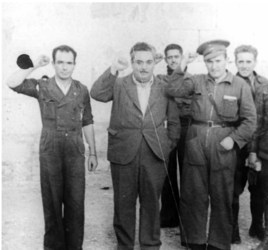
ILL. 2: Silvestre Revueltas at the Pozo Blanco front, August 1937 32 .