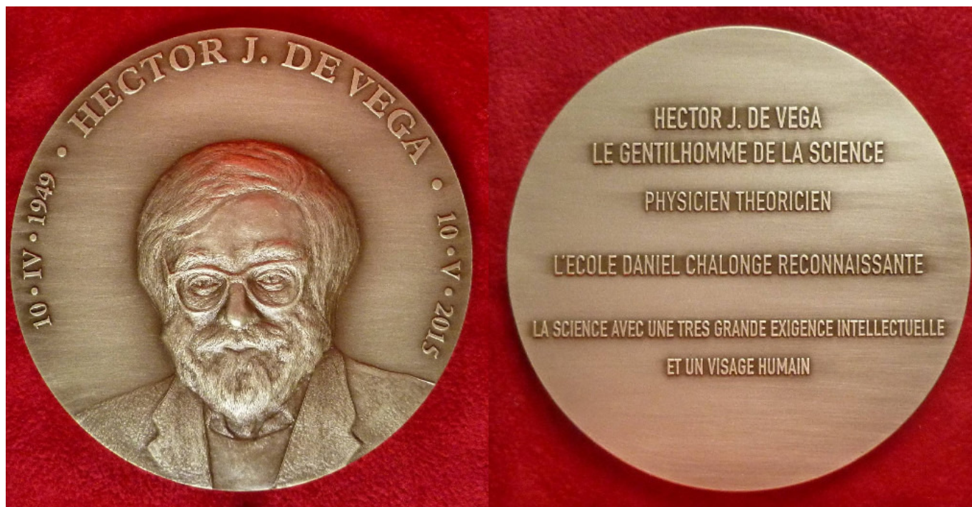
FIG. 2: The Héctor de Vega Medal

Science with a great intellectual exigency and a human face.