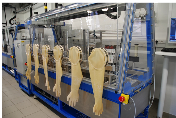
Figure 3 The Chemspeed Autoplant workstation.