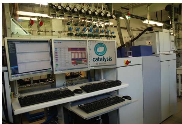
Figure 4 Avantium Flowrence unit.

The hood is equipped with H 2 O and O 2 detectors and gloves allowing the user to control the atmosphere inside the workstation and, if necessary, to carry out some tasks manually in the inertized hood (Fig. 3). Eight fully automated and instrumented high-pressure reactors (autoclaves) are installed in this workstation. Each reactor is equipped with a set of high-pressure pumps, gas flow and pressure controllers. Loading of solid, injection of liquid and gas, pressure (up to 80 bar) and temperature (−10°C to 250°C) can be controlled individually in each reactor. The reactors heads include an integrated reflux condenser and connections for temperature and pH probes and liquid sampling. Different stirrer designs (anchor or twisted blade) can be used, and are easily exchanged. Indirect online viscosity measurements can be carried out. In addition, reagents can be added during an application via a syringe pump. The reactors can be used in the batch, semi-batch or continuous modes.