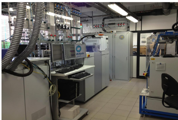
Figure 1 The REALCAT platform in September 2013.