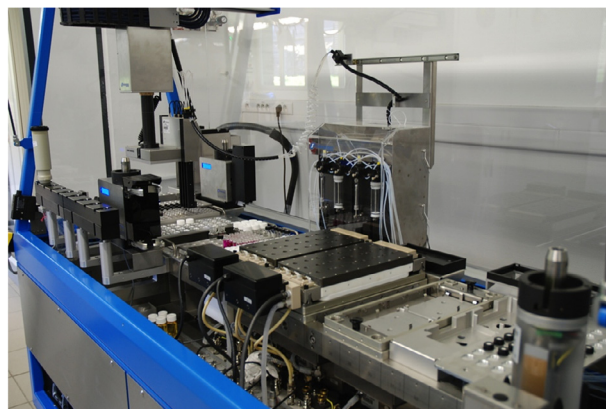
Figure 2 The Chemspeed Catimpreg workstation.