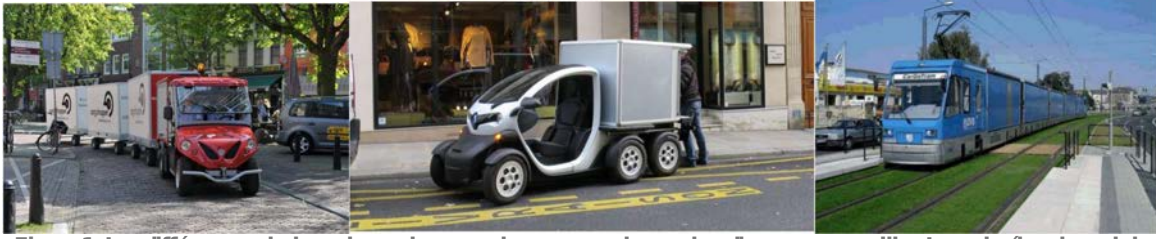
Fig. 1. Current possible alternatives for freight transport in the city center: The electric train in Gothenburg city (left); the electric vehicle project delivery Velud (center) and the Freight tram of Zurich (right).