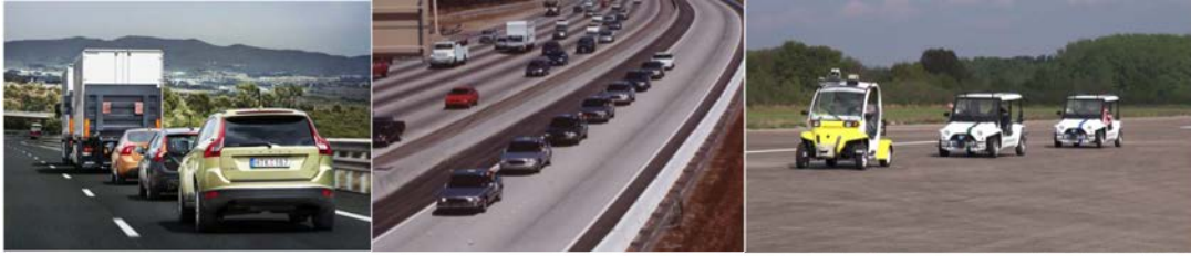
Fig. 2. Several projects dealing with the platoon control issues: Sartre (left), PATH project (center), SafePlatoon project (right)