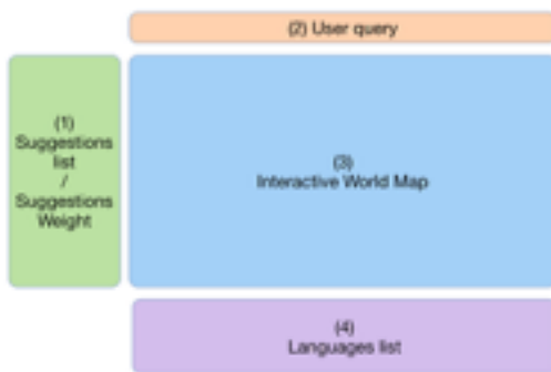
Figure 2: Mock-up of the user interface

While past searches, account preferences and browsing interests differ for every individual logged user, location-specific suggestions is the only universal discriminant for suggestion, whether the user is logged in or not. Several measures allowed us to establish which elements are used by Google to perform such content discrimination : the public IP that originated the request and the “hl” (which maybe stands for Human Language) parameter passed along with the query that express which language the user is commonly using (Browser, OS, Account).