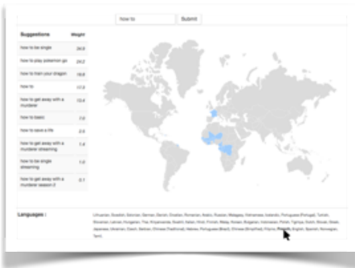
Figure 4: Mouse rollover a language

For the same query, the user rollovers a language name (French).