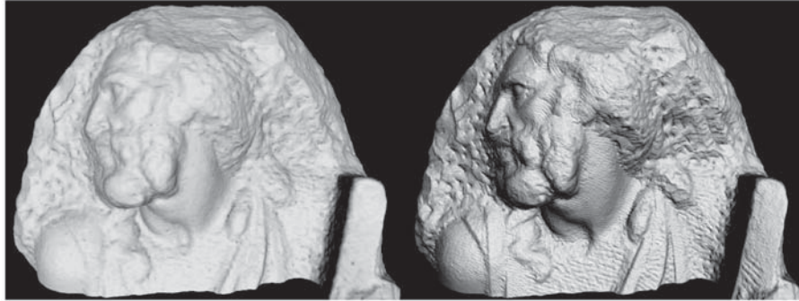
Fig. 1. Original models and their simplified versions. Notice the largely reduce size and the preserved appearance.