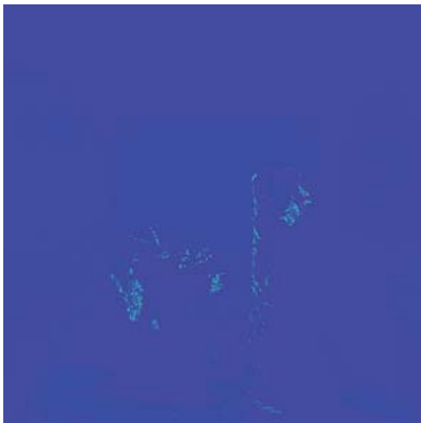
Fig. 4. Lab difference between fig. 2 and fig. 3. Brighter color means bigger error.