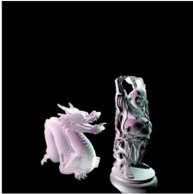
Fig. 2. Indirect illumination Visualization on high resolution models (1M triangles).