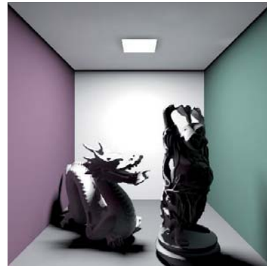
Fig. 5. Final image computed with direct and indirect illumination. The overhead introduced to include indirect illumination with our grid is very small (5% of the total rendering time).