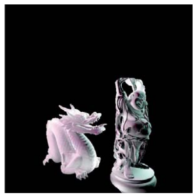
Fig. 3. Indirect illumination Visualization on low resolution models (100K triangles). The precomputation is 3 times faster than in fig. 2.