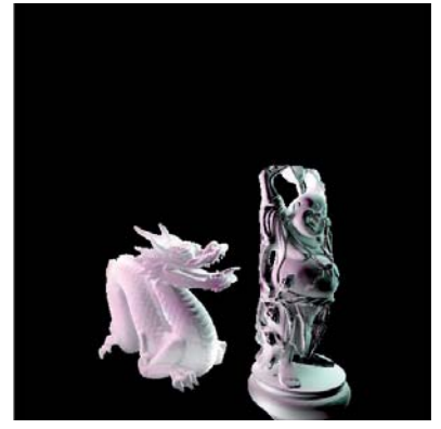
Fig. 2. Indirect illumination Visualization on high resolution models (1M triangles).