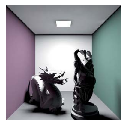
Fig. 5. Final image computed with direct and indirect illumination. The overhead introduced to include indirect illumination with our grid is very small (5% of the total rendering time).