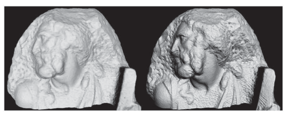
Fig. 1. Original models and their simplified versions. Notice the largely reduce size and the preserved appearance.