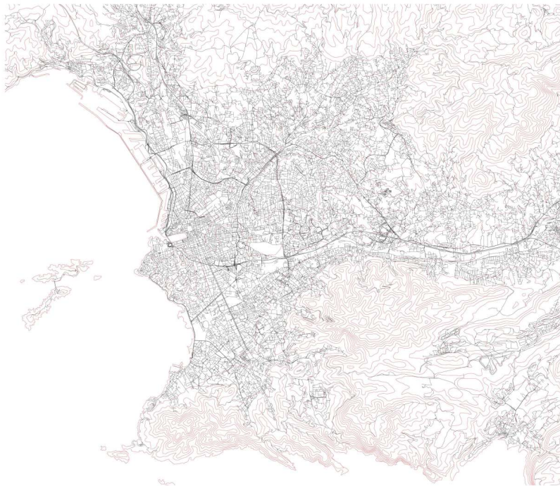
Figure 2 – The extensive urbanization of Marseille