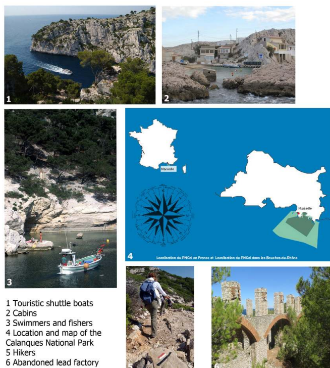
Figure 1 – The Calanques National Park: localisation, landscape and users