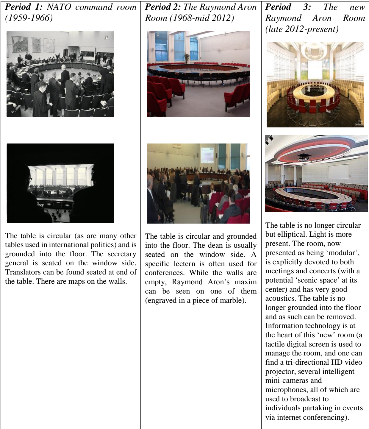
Figure 1. Views of the Raymond Aron (RA) room from 1959 to today

sponsors, conferences, debates and major research seminars (see Figure 1 below). In the paragraphs that follow, the field researcher personally reminisces about his experiences in and related to the room.