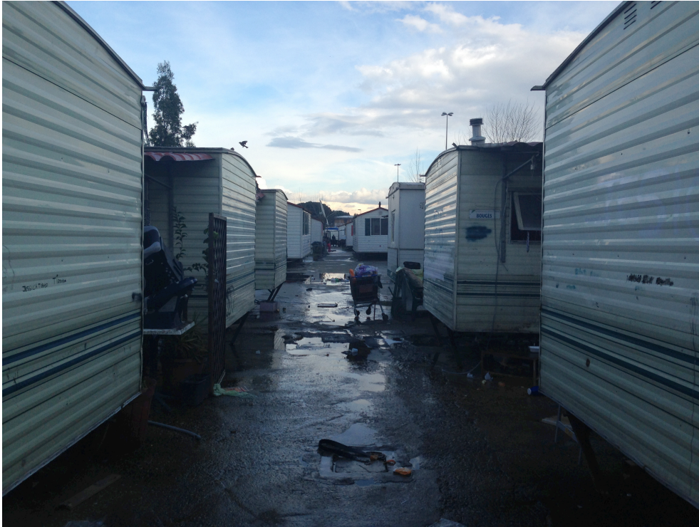
Picture 4. The caravans in Salone camp