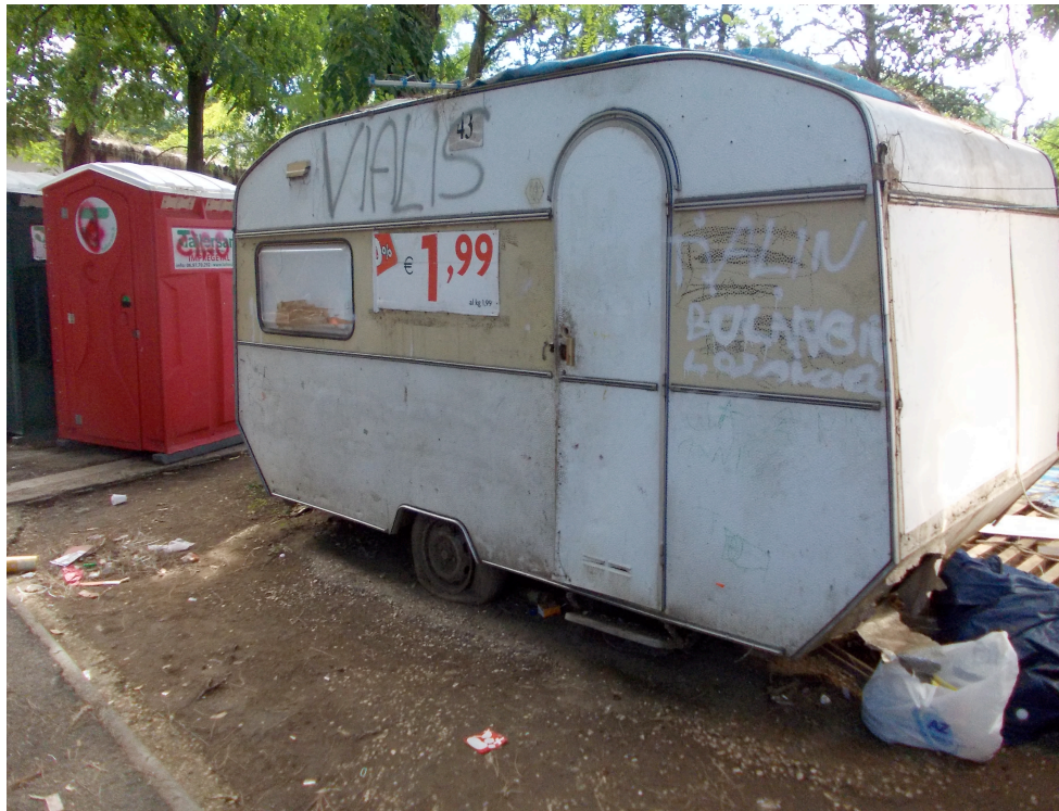
Picture 1. Picture of a caravan in Cesarina camp.