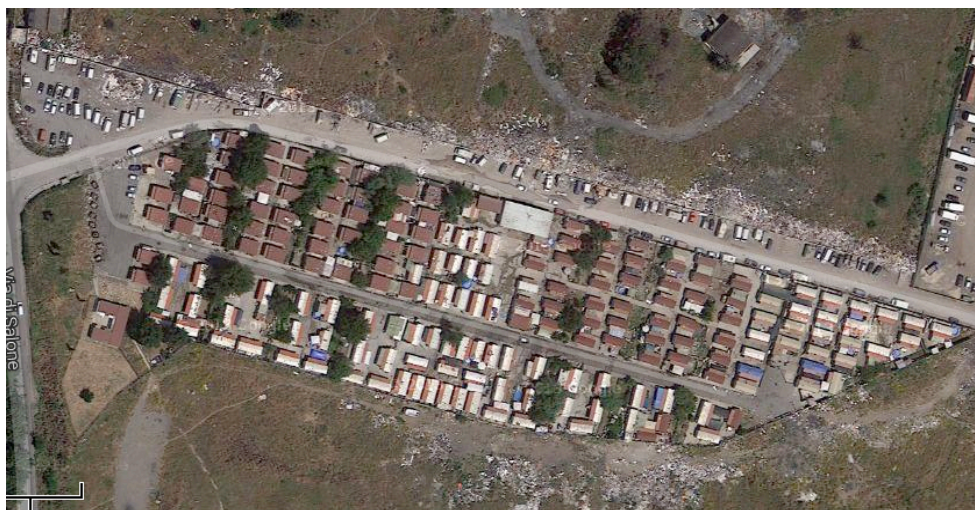
Picture 3. Satellite image of Salone camp.