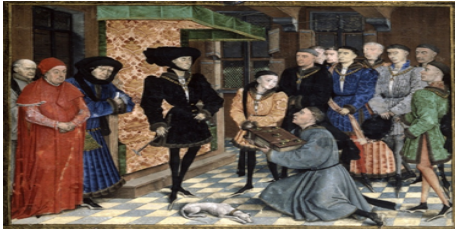
Figure 1: An illumination which illustrates the donation's scene of a luxurious illuminated manuscript to the Burgundy Duke, Philippe the Good. Brussels, Royal Library of Belgium, ms. 9243, folio 185 verso, Chronicles of Hainaut by Jean Wauquelin, 1446

in the court such as banquets, weddings or balls. Those scenes and their meanings change with the design's context and the messages to convey. In this design process, they are selected by the illuminator (the person who paints the images) according to the recipient's choices and drawn as images which are published in other political events such as the luxurious manuscript's donation to the Duke (scene described in the illumination of figure 1), banquet or knight's meeting.