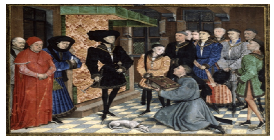
Figure 1: An illumination, it presents a scene of a luxurious manuscript's donation to the Burgundy Duke Philippe The Good. Brussels, Royal Library of Belgium, ms. 9243, folio 185 verso, Chronicles of Hainaut by Jean Wauquelin, 1446

In illuminations, some objects, characters or images as a whole are also considered as a sign (sometimes stronger than metaphor or working through metaphor). They are always made in artistic, religious or profane context. An illumination is part of a communication channel from the sponsor (the Duke for example), the author (illuminator) or the copyist of the book to the target (the Duke, a noble of his court, a politician, a king/queen or an important figure in a European court). It represents themes corresponding to the sponsor/recipient, his social level, his cultural settings, his family or his society in the past, the present, the future (after death). Then it aims to give an ideological representation of the sponsor. Implicitly, it serves to convey ideas or to idealise relationships, chivalrous and religious values. Explicitly, it illustrated scenes of life in the court such as banquets, weddings, balls, etc. The scenes it describes and their meanings are not unique and change with the context. In the design process, these scenes were selected by a writer (the illuminator, the person who paints the images) according to the recipient's choices and drawn as images. These images served as information to be disseminated about the Duke and the activities in the court and to be published during political events such as the luxurious manuscripts donation to the Duke (scene described in the illumination depicted in figure 1), a banquet or a large knight's assembly.