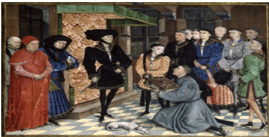
Figure 1: Illumination presenting a scene of a manuscript donation to the Burgundy Duke. Brussels, Royal Library of Belgium, ms. 9243, folio 185 verso, Chronicles of Hainaut by Jean Wauquelin, 1446

In illuminations, some objects, characters or images as a whole are also considered as a sign (sometimes stronger than metaphor or working through metaphor). An illumination is always made in artistic, religious or profane context. It is part of a communication channel from the sponsor (here, the Duke of Burgundy), the author (illuminator) or the copyist of the book to the target (the Duke, a noble of his court, a politician, a king / queen or an important figure in a European court). It represents themes corresponding to the sponsor / recipient, his social level, his cultural settings, his family; his society in the past, the present, the future (after death). Then it aims to give an ideological representation of the sponsor. Implicitly it serves to convey ideas; idealize relationships, chivalrous and religious values. Explicitly it illustrated scenes of life in the court such as banquets, weddings, balls, etc. The scenes it describes and their meanings are not unique, they change with the context. These scenes were selected by a writer (the illuminator, the person who paints the images) and drawn as images. These images served as information to be disseminated about the Duke and the activities in the court and to be published during political events such as the luxurious manuscripts donation to the Duke (scene described in the Duke illumination depicted by the figure 1), a banquet or a large knight's assembly.