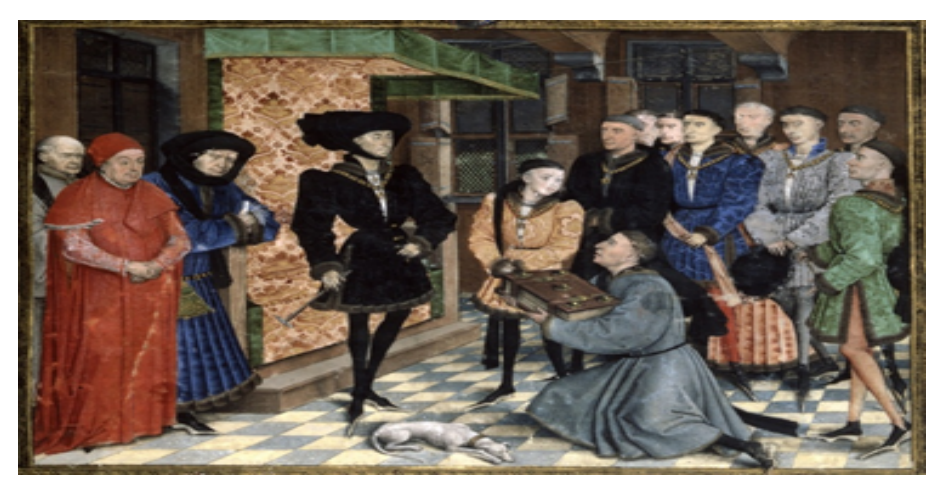
Figure 1: Illumination presenting a scene of a manuscript donation to the Burgundy Duke. Brussels, Royal Library of Belgium, ms. 9243, folio 185 verso, Chronicles of Hainaut by Jean Wauquelin, 1446

his family, his society in the past, the present, the future (after death). Implicitly it serves to convey ideas, idealised relationships, chivalrous and religious values. Explicitly it represents scenes of court life such as banquets, weddings, balls, tournaments, etc. The scenes it describes and their meanings are not fixed, they vary according to the contexts. These event scenes are selected by a writer (the illuminator, the person who paints the images) and drawn as an image. These images serve as information vehicles about the Duke and the ducal court activities and are presented to the public during future political events such as the luxurious manuscript donation to the Duke (scene described in the Duke illumination depicted by the figure 1), a banquet or a large knights assembly.