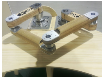
Figure 3: Final prototype of a wooden five-bar mechanism.

in Figure 2b. All models and optimisation algorithms have been encoded with Matlab in the Windows 7 environment. The computation time took around 4948 sec (for a Pentium 4 2.70 GHz, 16 GB of RAM).