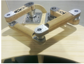
Figure 3: Final prototype of a wooden five-bar mechanism.

in Figure 2b. All models and optimisation algorithms have been encoded with Matlab in the Windows 7 environment. The computation time took around 4948 sec (for a Pentium 4 2.70 GHz, 16 GB of RAM).