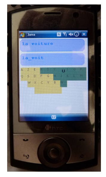
Figure 3: TinyEAssist

Experimentation protocols are described in XML. This allows users to easily manage different groups of participants, each with specific characteristics (such as age range or impairment). It also facilitates organization of instructions to participants, experiment tasks, and delays between exercises. The experimentation may be multi-session.