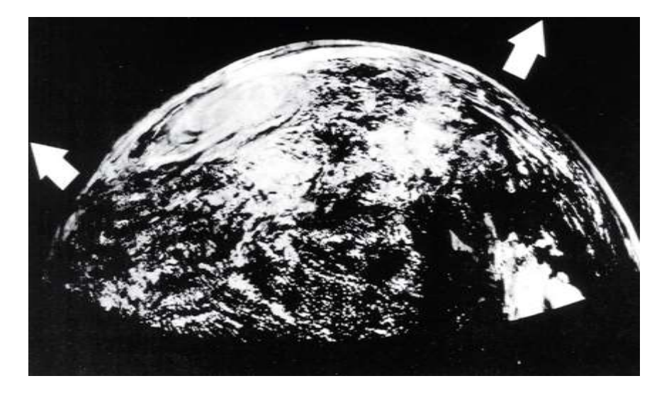
Figure 8.1 Black-and-white photomontage of more than 100 individual photographs obtained during a US Navy Aerobee flight in 1954 and mounted on a sphere by NR L scientist Otto Berg. A large whirlpool of cloud left over from a tropical cyclone above the Gulf of Mexico, discovered by chance, is visible in the upper left of the image

The photographic mosaic, however, also demonstrated the advantages of combining different techniques of analysis of pictorial evidence consisting of composing images and then treating them with a variety of meteorological methods.