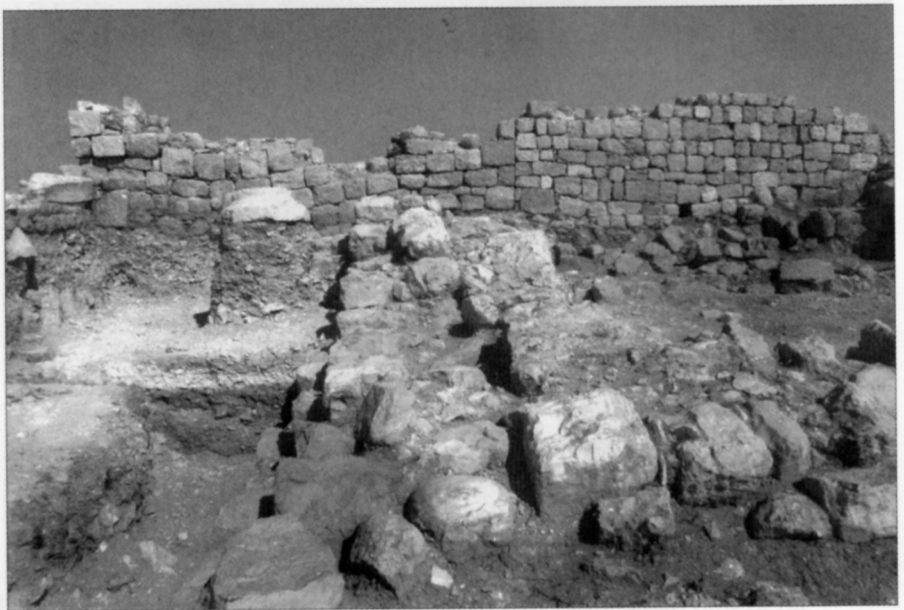
Fig. 8 Mount Nebo - Mukhayyat. Areas C and D (from the West).