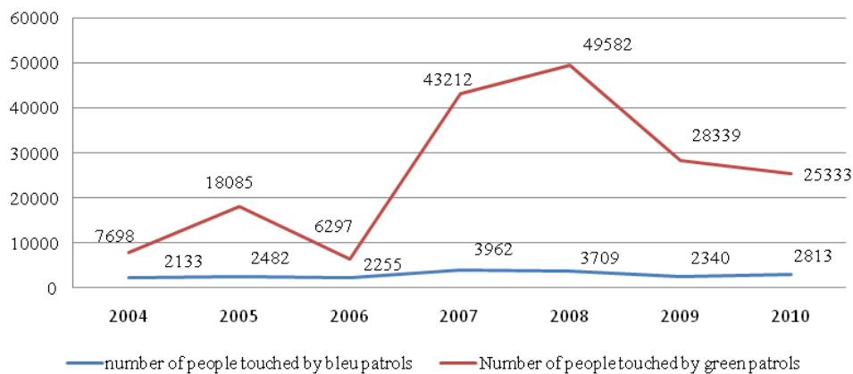
Figure 2. Evolution in the number of people touched by green and blue patrols since 2004

And yet, this information alone is not sufficient to address the issue of defining levels of overuse. Indeed, what defines a situation of overuse? Based on what criteria? But also according to whom?