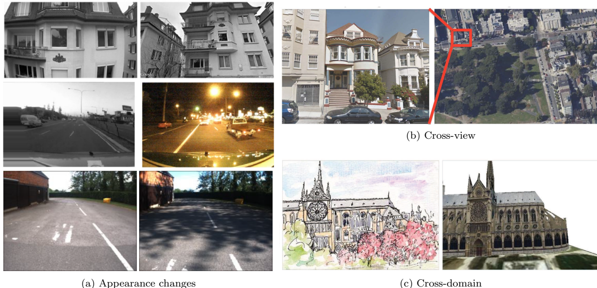
Figure 2: Illustration of appearance changes present in VBL system: (a) Visual dissimilarity between the query (left) and the closest image in the database (right). Cause of the change, from top to bottom: viewpoint differences in a system for MAV localization in urban environment from [115], extreme illumination changes from [127], shadow interferences from [43]. (b) Cross-view localization system from [105]: left represent the ground-level query image and right the bird’s eye view of the same scene (red rectangle). (c) Cross-domain VBL system from [10]: on the left the query painting and on the right the corresponding pose according to a 3D model.

As pointed out by Lowry et al. [111], permanent changes occurring in our environment is a huge concern in vision domain. In VBL, to the difference of SLAM based navigation methods [54, 111], the environment representation (i.e. the database) is most of the time acquired at a single date and query can be opposed to the system years after. To take into account local changes of the environment the database needs to be updated. Depending on the size of the covered area, database update can be a costly operation. Thus, an ideal VBL system should be able to handle minor visual changes from various sources: daily and season cycle, difference in viewpoint or modifications of the local geometry of the scene. In this section we review selected VBL papers that tackle the problem of visual changes in the environment. We dedicate the second part of the section to localization methods that consider extreme appearance changes between the query and the database, namely: cross-view and cross-domain VBL systems.