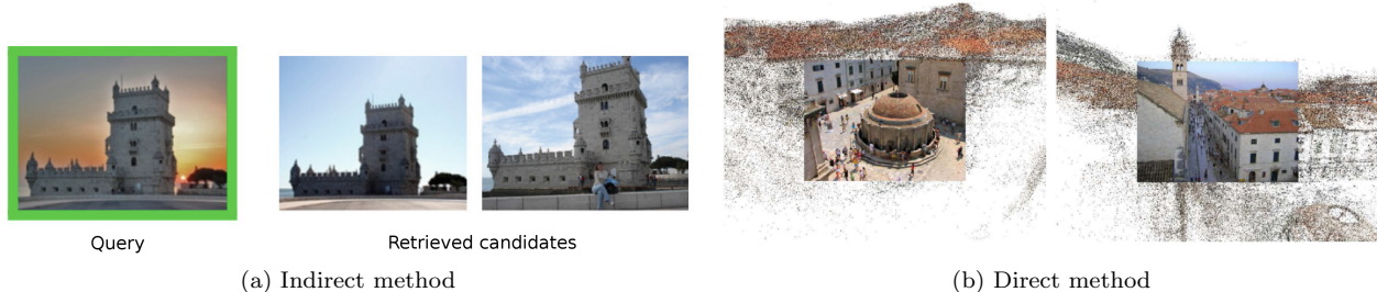
Figure 1: Examples of Visual Based Localization systems: (a) indirect method from [160]: according to an input query (left images), indirect methods recover a set of similar data (right images). (b) direct method from [49]: direct methods recover the exact pose of the input query (the two figures represents superposed images according to a reference 3D model).

As well as VBL presents a heterogeneity about its end-user applications, methods and data involved in the process of localizing an image are various. These methods are divided into two categories: indirect methods [2, 160] (see figure 1a) that cast the localization task as an image retrieval problem and provide a coarse pose information about the query location and direct methods [80, 176] (see figure 1b) that directly regress the 6 Degrees of Freedom (DoF) pose of the visual acquisition system. Indirect methods used in VBL slightly differ from classical vision object-retrieval algorithm [185] on two points: the images in the query and the database represent scenes rather than objects ( e.g. street view panorama, buildings images, indoor scenes) and the performance of such system is evaluated according to the precision rate rather than the recall rate (i.e. a perfect VBL system should recover in its top ranked candidates documents that display the exact location of the query). Unlike indirect methods, direct methods aim to recover instantly the pose of the query data. Where Structure from Motion (SfM) or SLAM techniques provide a relative pose of a sequence of data, VBL tackles the problem of retrieving the absolute pose of a query data according to a known representation. Nevertheless, this representation could have been built thanks to SfM or SLAM mapping module. Figure 1 presents representatives of the two different methods studied in this survey.