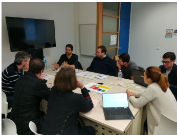
Figure 2: The four secondary school teachers interacting with the design cards and board during the workshop.

more related to the domain (e.g. a heart that fills up when you go to the gym to promote healthy living). Using domain-dependant metaphors can favour explicit connections with the given activity as recommended by Nicholson [16]. However, the choice depends on users' intrinsic motivation for the domain and an independent style can reduce the risk of user' amotivation.