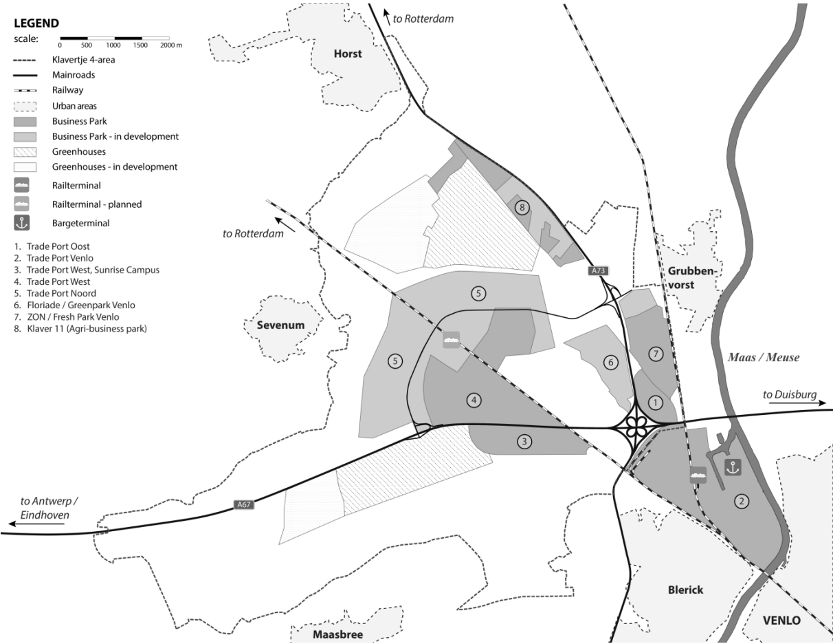
Figure 3: Logistics parks, agribusiness and infrastructure in the Venlo region (own compilation)

This allows the DCGV to provide (financial) incentives to firms. This new organisation is more reactive to the demands of global logistics real estate developers and investors such as Prologis, Goodman or WDP.