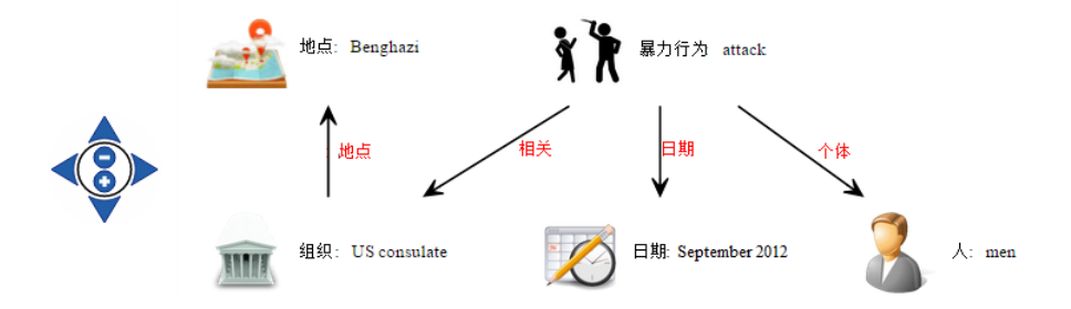
Fig. 1. RDF graph of the example 1

Faceted search: As we have already stated, the graph can be dense and hardly understandable, here we propose a selection of subgraphs which can help the user to directly visualize the relevant information. Two selections are proposed: