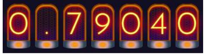
Fig. 3. This is Steins gate’s choice: \gamma = 0.79040 . For items having at least one rating, it is better to rely more on the ratings predicted by ALS than by LASSO.