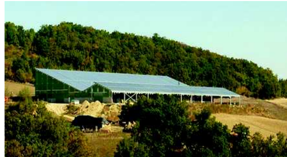
Figure 1: The demonstrator is located on the farm in Saint-Marcel. The photovoltaic plant has a power of 777 kWp for a surface of 7000 m 2 .

To measure the performance of cooling software, we compare the power output differential of the two PV fields and the quantity of water, expressed in % [1]. The PV Performance Ratio (PR) was not used here, because the effectiveness of a rainwater-based cooling system relates to weather variables other than solar irradiation (seasonal precipitations, humidity, wind characteristics).