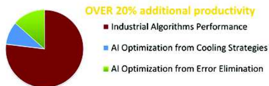
Figure 5: AI compared to traditional algorithms.

The standard MAS context is currently used in several applications (singularity detections in a Building Management System [11], heat engine calibration [4], robotic learning from demonstration [8], ambient systems [7], bioprocess control [5]) and is currently in the integration phase for large-scale agricultural project.