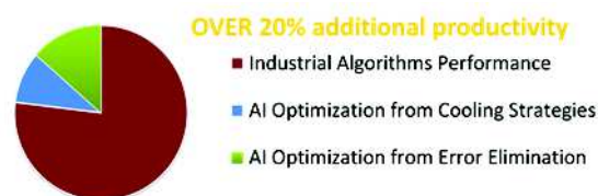
Figure 5: AI compared to traditional algorithms.

The standard MAS context is currently used in several applications (singularity detections in a Building Management System [11], heat engine calibration [4], robotic learning from demonstration [8], ambient systems [7], bioprocess control [5]) and is currently in the integration phase for large-scale agricultural project.