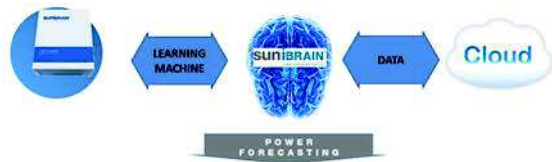
Figure 3: The development industrial control software with an optimisation approach offered by AMAS.

We compare the outcome of this software with an alternative optimisation approach offered by an Artificial Intelligence technique (Fig.3): called Adaptive Multi-Agent Systems (AMAS). The AMAS approach has been successfully used in many domains of applications for controlling, in a real-time manner, systems such as car heat engines [4], bioprocesses [5], videogames [6], robots [7] or ambient systems [8].