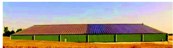
Figure 2: Twin generator of 250 kWh.

The initial research uses a twin solar system (specially built in 2011 to offer the possibility of real-time comparison). The installation consists of a steel roof with mounting systems and PV modules with two identical solar generators of which one only is equipped with rainwater-cooling. In 2015 a second twin generator of 250 kWh was equipped in a region benefitting from different weather patterns (Figure 2).