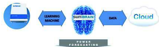
Figure 3: The development industrial control software with an optimisation approach offered by AMAS.

We compare the outcome of this software with an alternative optimisation approach offered by an Artificial Intelligence technique (Fig.3): called Adaptive Multi-Agent Systems (AMAS). The AMAS approach has been successfully used in many domains of applications for controlling, in a real-time manner, systems such as car heat engines [4], bioprocesses [5], videogames [6], robots [7] or ambient systems [8].