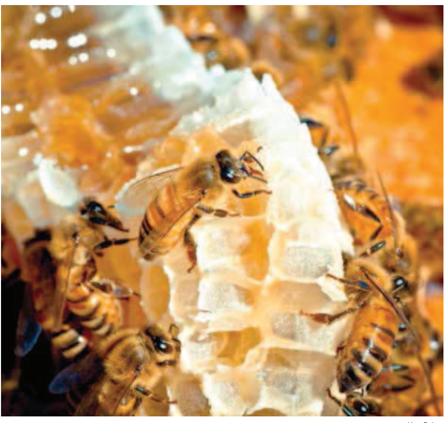
A new toolbox of 23 indicators offers a system for quickly assessing genetic, species, and habitat diversity on farms. One of the indicators is the number and species count of bees.

We now know some of the many uses of the BioBio indicator toolbox. It can be applied on individual farms, particularly large farms that want to—but currently cannot—accurately advertise the status of biodiversity on their land. Label organizations and administrators, too, can benefit from BioBio: the former as they claim to promote biodiversity-friendly practices,