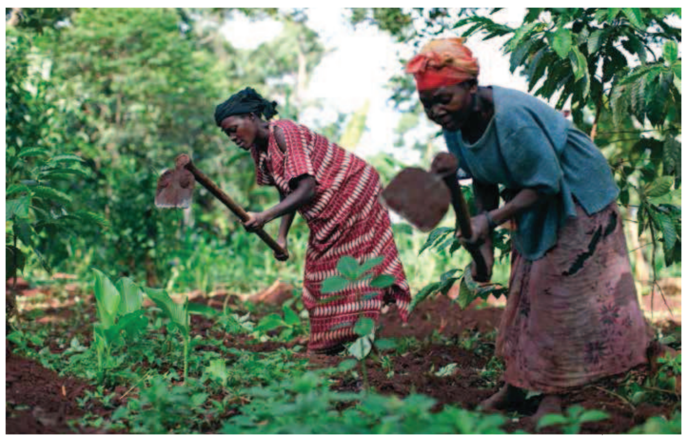
Though tested mainly in Europe, pilots were also conducted on Tunisian and Ugandan farms, like this one. Once adapted to the environment, the toolbox could help promote localized best practices for agriculture around the world.

European Union (Grant KBBE 227161) and by the Austrian Ministry for Science and Research. We thank the farmers for access to their land and for the information obtained through interviews.