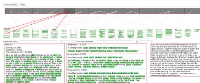
Figure 2: Alignment prototype screenshot.

ment are represented by a weighted bipartite graph, and is intended to enable researchers to analyze the quality of the alignment and of the computed weights.