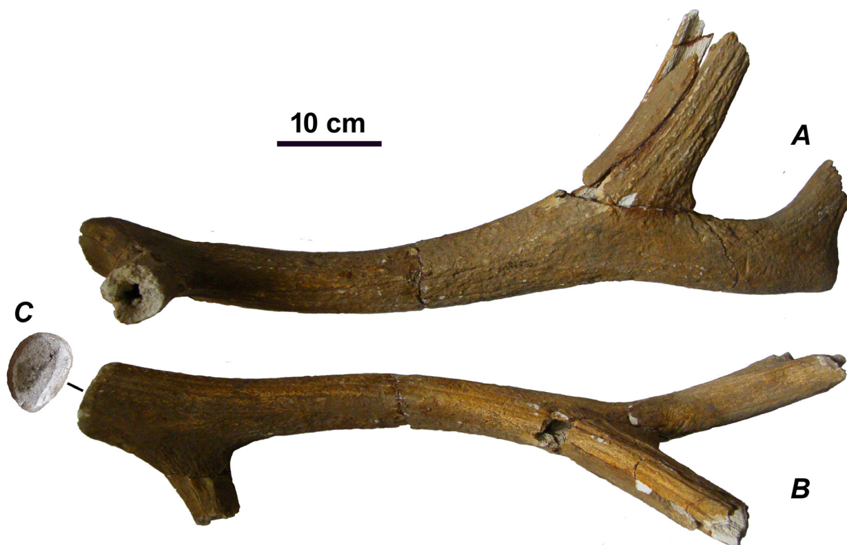
Figure 2. The distal fragment of the left antler of Cervus canadensis from Climăuți II CLM-II-381: A, lateral view; B, upper view; C, view from the broken proximal side.

ulna Nr. 5.22, which was regarded by Friant (1957: Pl. IV, fig. 8) as evidence for the complete fusion of radius and ulna in the Kent's Cavern giant stag, actually belongs to a horse (Lister, 1987). Lister (1987), however, confirmed that the osteological remains of the cave stag from Kent's Cavern are much larger than those of any living European red deer and equal in size to modern American and Siberian wapiti. Lister (1987) also indicated stockier limb bones of the wapiti-like deer from Kent's Cavern ("too short for their breadth": ibidem ), which approach the proportions of westernmost living wapiti C. canadensis songaricus ( C. elaphus songaricus according to Lister, 1987).