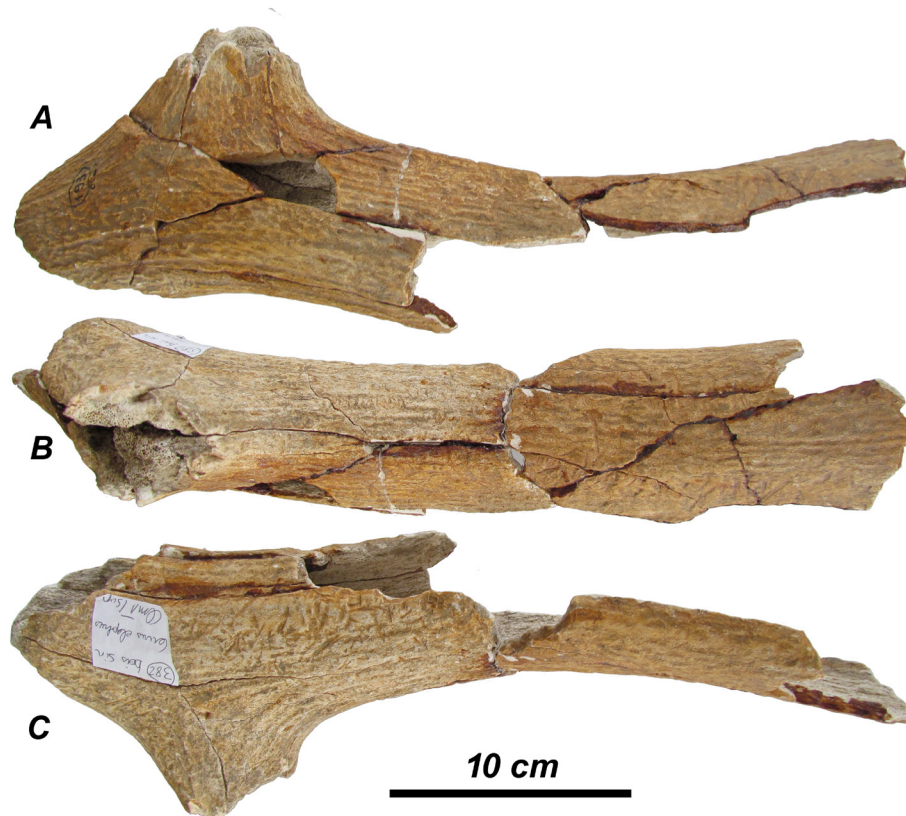
Figure 4. The fragment of the left antler of Cervus canadensis from Climăuți II CLM-II-382 with basal portion of the broken middle tine: A, lateral side; B, upper side; C, middle side with cut marks.

Zdansky, 1925 (255 mm) from the Pleistocene of China (Zdansky, 1925: Pl. XV, fig. 1). However, the antler of Chinese wapiti has a longer crown part.