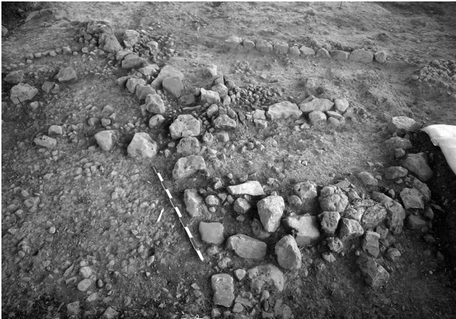
Fig. 3 View of Loci 200 and 201 from the south, Sector E.

period less than the earlier one. This may appear as a paradox but, in fact, the later structures are preserved only in the SW corner of Sector E, an area enlarged only during the second week of the excavation.