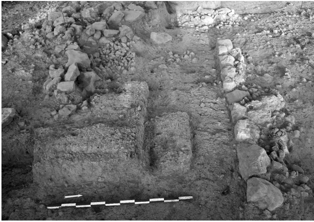
Fig. 2 View of Loci 202 and 205 from the east, Sector E.