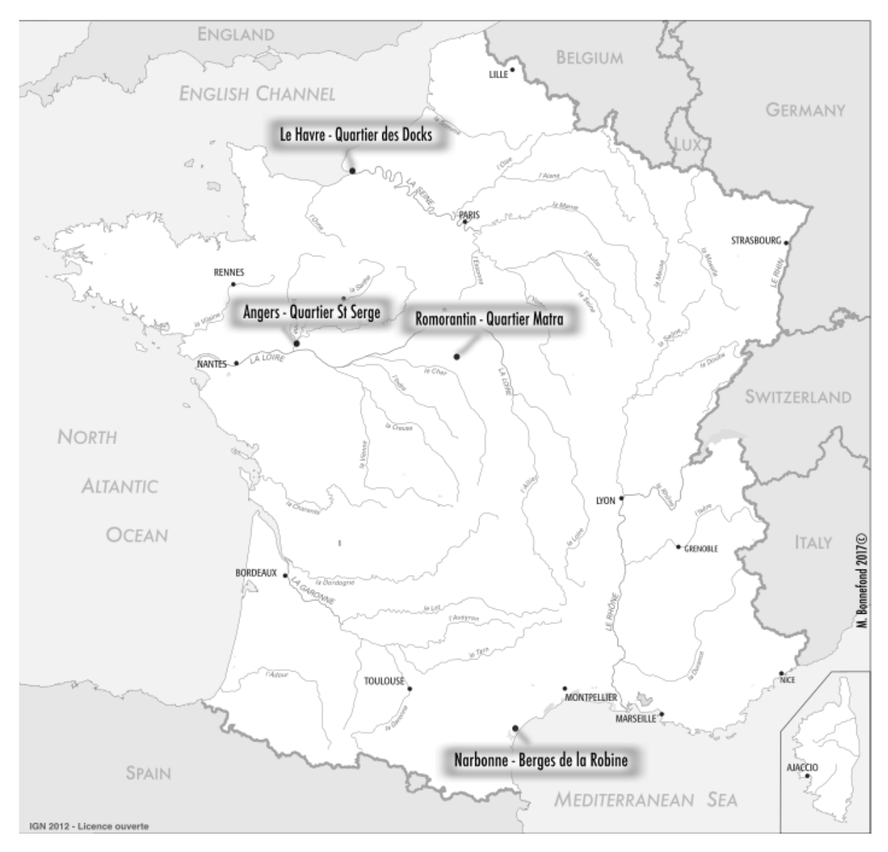
Figure 1. Four case studies in four medium-sized and small French cities

France. Interestingly, the Matra neighbourhood we are looking at in this town has been designed as a resilient district. Implemented on the site of a former industrial brownfield, it was flooded in June 2016, a very short time after its completion. A member of the PRECIEU research team, the architect in charge of the project, made sure the neighbourhood could contribute to the design process and take part in the integration of flood risks in the overall project. The research team assumes that combining state-of-the-art knowledge with the results of these four case studies provides a good basis to illustrate how global trends in resilient urban design practices happen to be implemented in the French context.