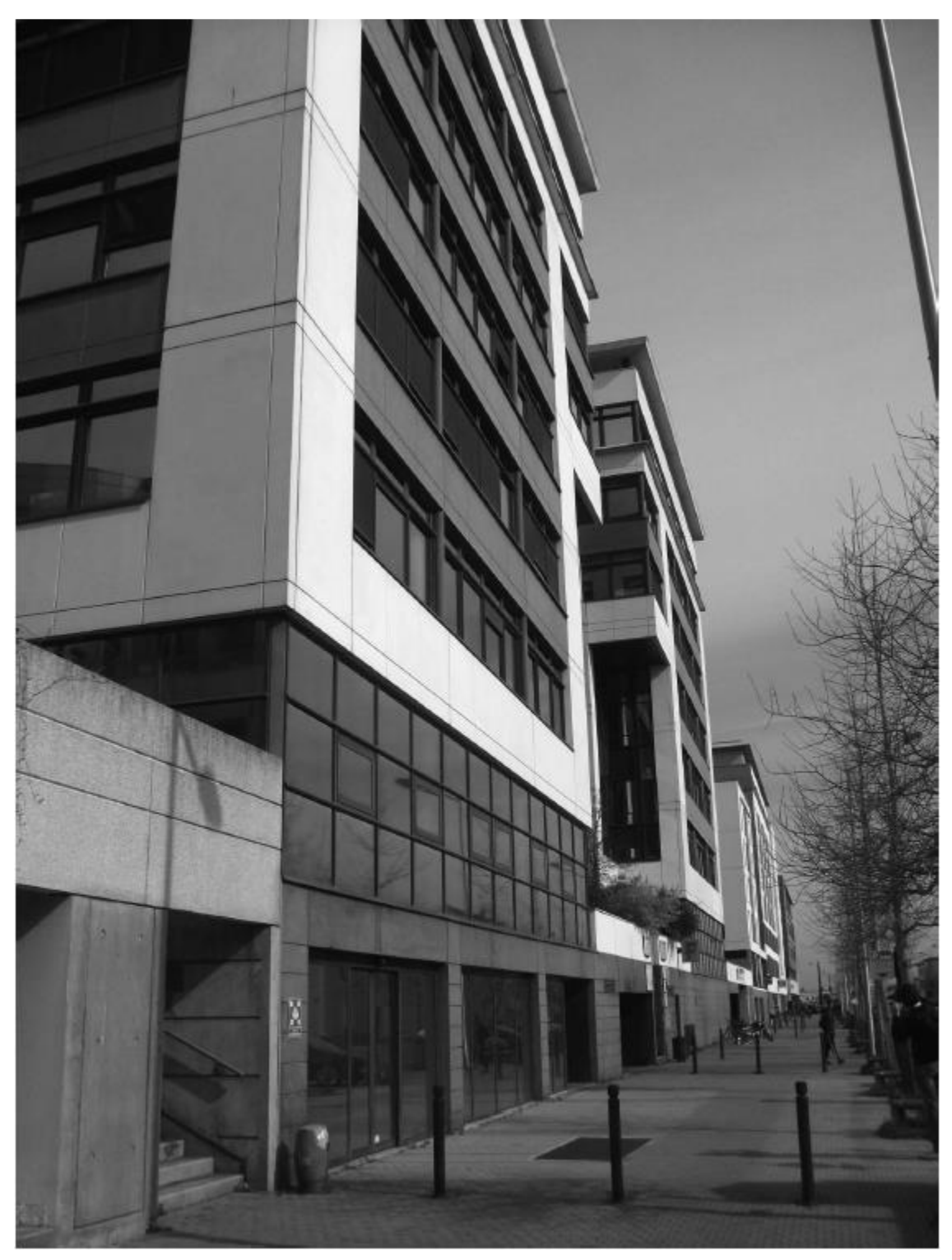
Figure 2 Example of an entrance to groundfloor parking and treatment of façades on the street side. Access for vehicles in the car park via a ramp. This device protects the car park and the first floor in case of flooding.

A direct result of flood constraints, this decision gives the area an urban form of its own. The slab overhanging the roadway by approximately three metres produces a kind of 'fortress street' (Creton-Cazanave et al., 2016, 115) with significant changes in terms of how city dwellers navigate and relate to the street (Figures 3 and 4). The area is accessible by stairways, with no direct access to the street