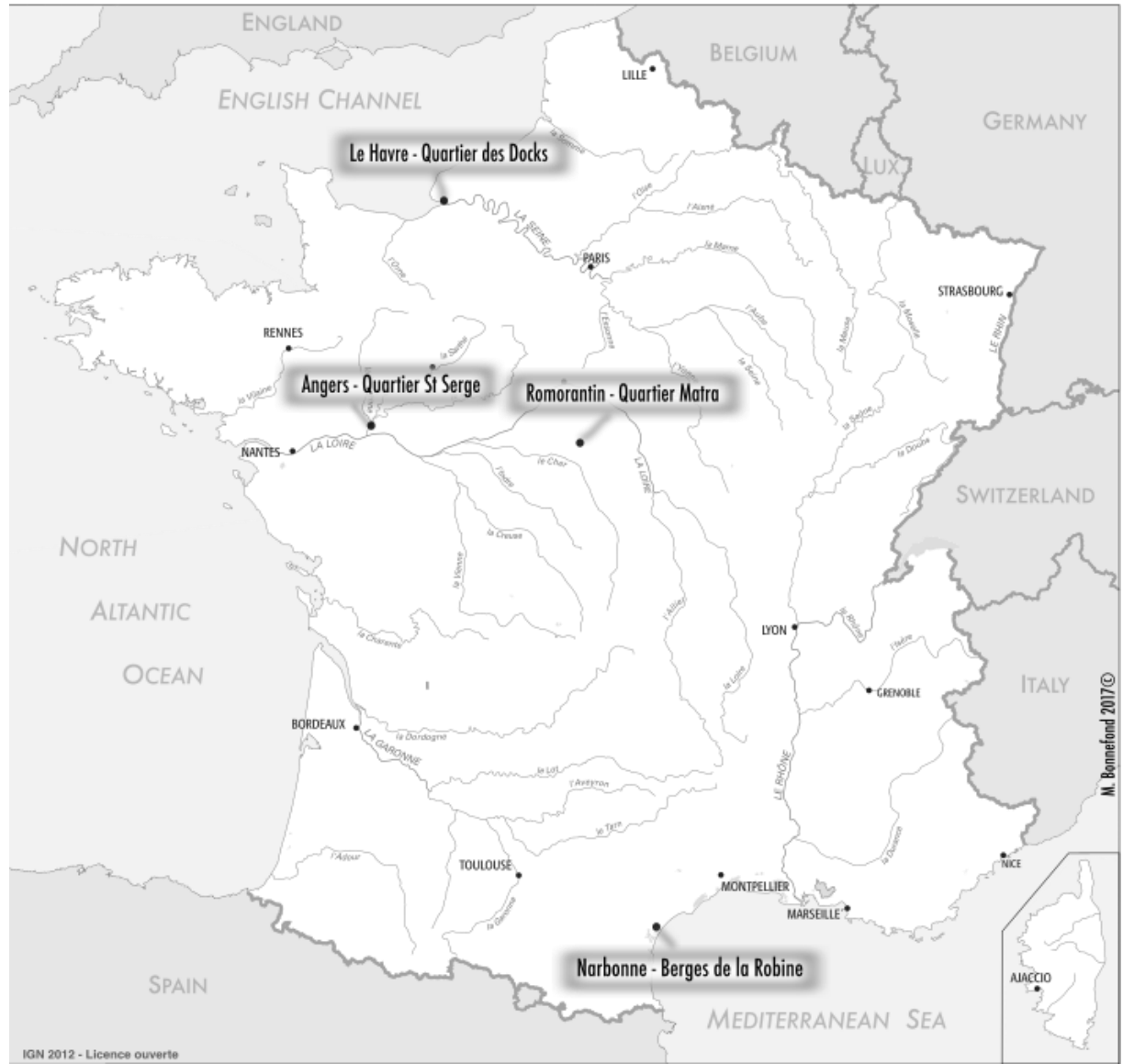
Figure 1. Four case studies in four medium-sized and small French cities ENGLAND

As mentioned previously, our main objective is to understand the way in which flood risks are integrated in resilient urban project dynamics. In order to reach this goal, the comparative analyses conducted by PRECIEU rely for each development project on a set of formal documents, including preliminary studies made at the conception stage. In addition, the PRECIEU team interviewed key players on each project, paying special attention to the urban professionals who were involved in their design: architects, landscape designers, urban designers, developers, political figures and project managers. In total, fifty semi-structured interviews were conducted between 2014 and 2016. The methodology also included on-site visits as well as the organisation of two scientific and technical