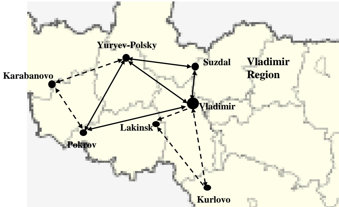
Fig.3. Prospective TRN in the Vladimirsky Oblast