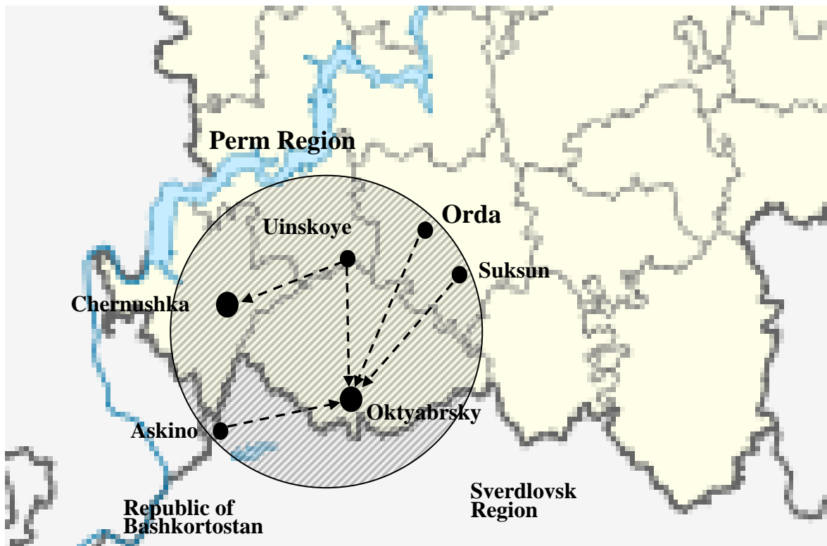
Fig.2. Prospective ACN in the Perm Krai